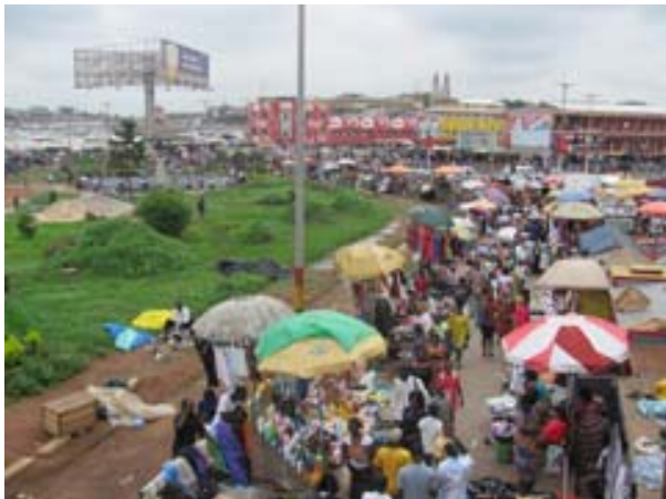
Or wandering through the largest market in West Africa.