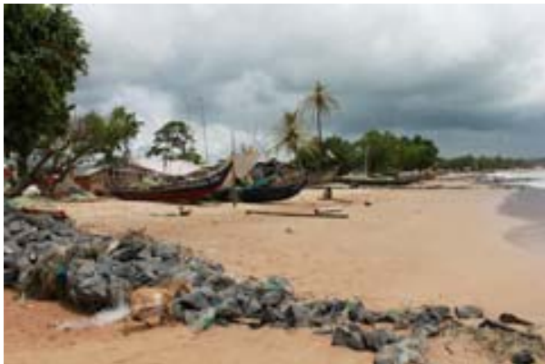
Or accidentally stumbling upon beautiful Busua Beach.