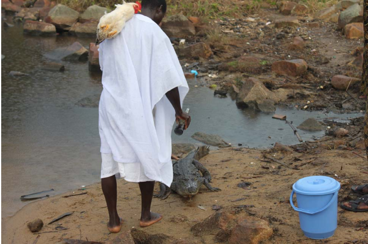
And a day later watching a Ghanaian fetish priest feed a chicken to a crocodile in a sacred ceremony.