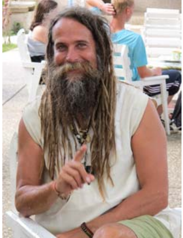
Or meeting a Rastafarian named "Bunny Eye," who inexplicably insisted on calling me "Olive Oyl."