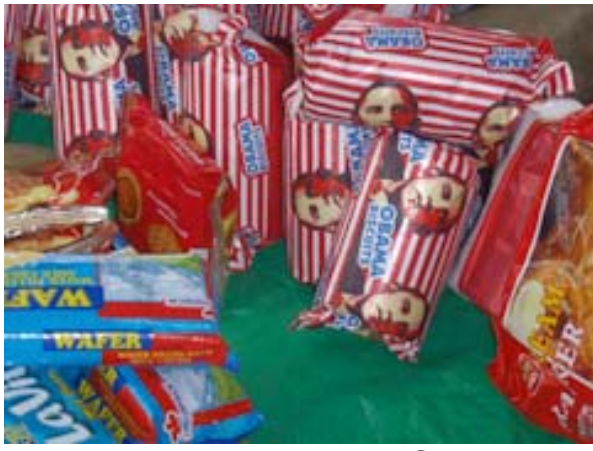
And marveling at how much Ghanaians love Barack Obama.